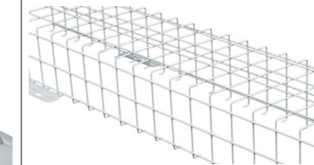
The metal grid protects the luminaire against mechanical damage and unauthorised handling. It is attached to the surface with the use of screws. The surface is treated with the RAL 9003 powder-coated color.