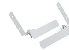
Side hanger with blocking It serves to attach the light fitting to the wall with the possibility of its positioning.