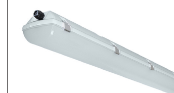
Translucent polycarbonate (PC), UV stable, impact-resistant (IK10) Fire & ignition resistance (850 C°)