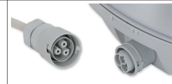
Connector on clients request Stucchi connector