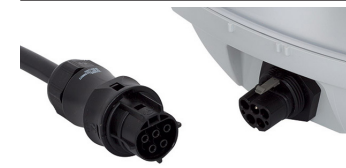
Connector on clients request Wieland connector